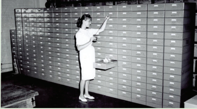
The United States Census Bureau has had census records on microfilm since 1940.