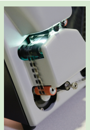
The Mekel Technology MACH10 microfilm scanners can digitize up to 700 images per minute for cost-efficient scanning of large collections.