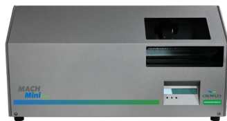
Captures up to 600 dpi true optical resolution

The MACH Mini Fiche offers the same 100% accurate capture of the MACH7 in an economic table top design. The manual-load scanner is ideal for those with mid-volume microfiche capture needs.