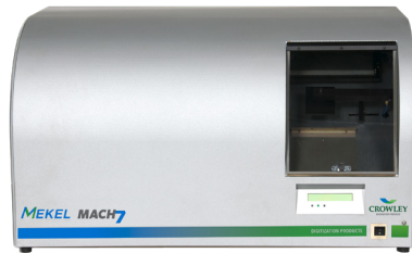
Digitizes up to 200 images per minute and captures all microfiche and aperture card formats

In addition to the high-resolution camera used for image capture, MACH-Series microfiche scanners employ a separate prescan and title bar camera used for image location. With this unique configuration, the scanners skip the blank spaces on a fiche that is not full, allowing for a speed not seen in competitive units. With Quantum software, the MACH7 offers serpentine scanning for even faster throughput, Optical Character Recognition (OCR) and opaque capture for aperture card text and title bar capture.