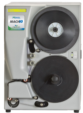
MACH10 and the MACH Mini Film have a true optical dpi range of 100-600; speeds vary depending on dpi.

The MACH10 uses a focused LED light source, runs on QuantumScan and QuantumProcess software, creates quality bitonal and grayscale images from microfilm in various states of composition and scans up to 1,000 foot individual rolls. Digitizing up to 1400 images per minute at 200 dpi, this unit scans to FADGI, Library of Congress, Metamorphoze, NARA and NDNP preservation specifications for both 16 mm and 35 mm film.